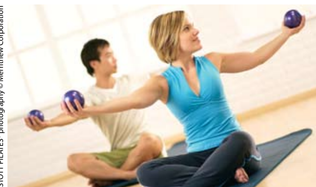
STOTT PILATES® photography © Merrithew Corporation

When time is tight, circuit training is the perfect solution. Moving quickly between sets keeps your heart rate up, allowing you to reap the benefits of cardiovascular training while working your muscles. Try a three-day routine rotating workouts for upper body, lower body and cardio.