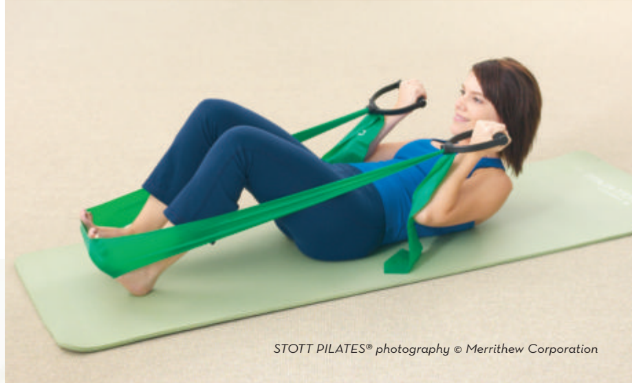
STOTT PILATES® photography © Merrithew Corporation

For more information, visit www.stottpilates.com